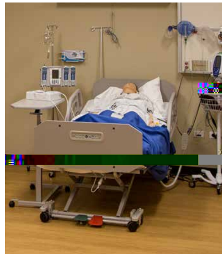
Acute Care Labs in Oak Brook are designed to simulate

exam rooms in Oak Brook allow nurses to advance their knowledge to become nurse practitioners and other advanced nursing experts. Named #1 best private